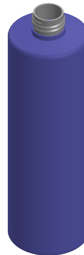
SZCZEGÓŁ A SKALA 2 : 1

3.18 ± 0.1 Pitch 2.2 ± 0.1 Start of thread 2 turns of thread